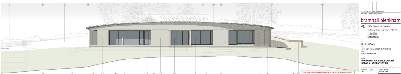
SOUTH-FACING ELEVATION 1:100 01/2020